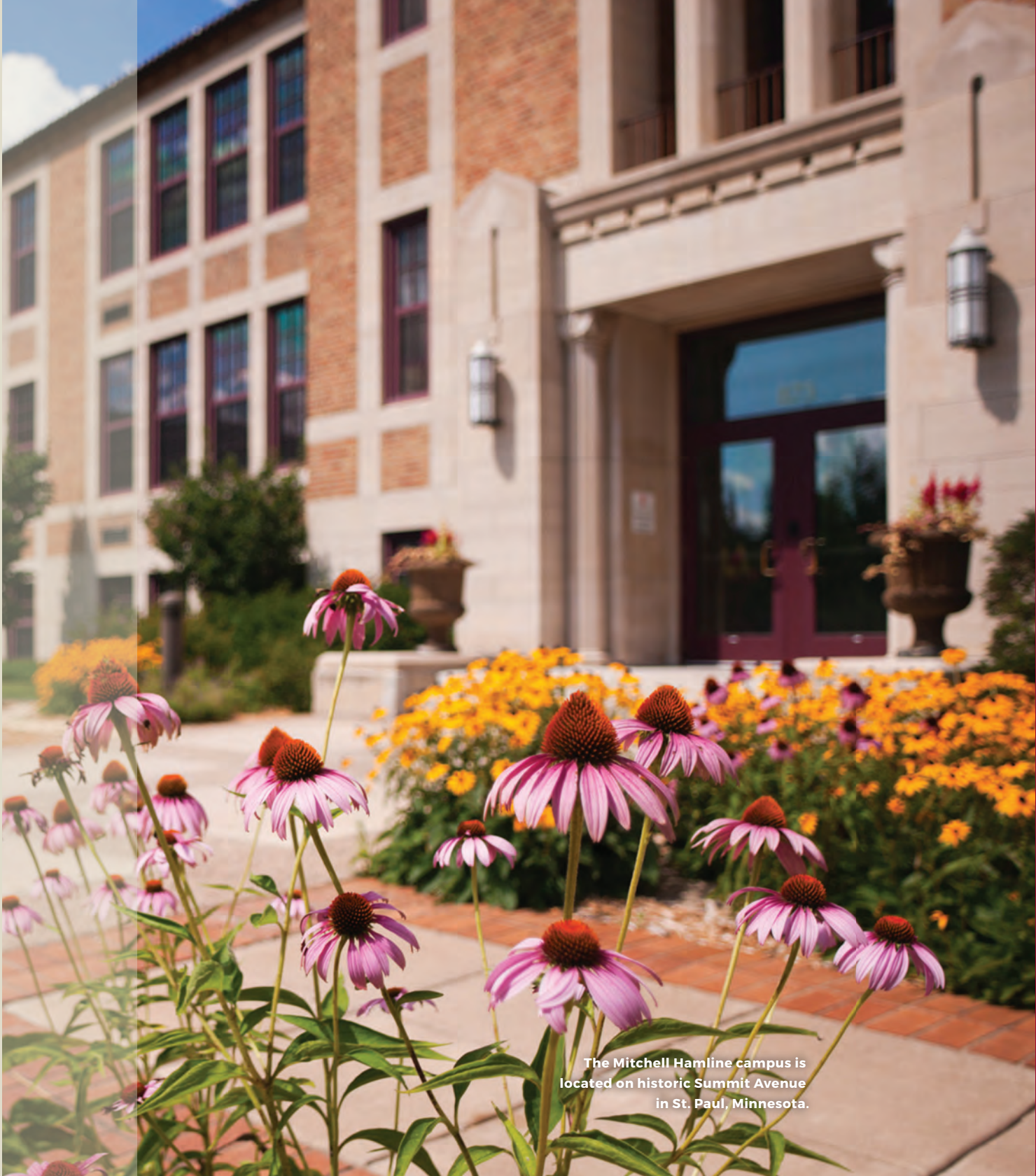
The Mitchell Hamline campus is located on historic Summit Avenue in St. Paul, Minnesota.

At Mitchell Hamline School of Law, we have been educating lawyers for more than 100 years but are still innovating to respond to the changing legal world. Let us help you put your dreams to work.