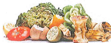
FOOD WASTE AND LIQUIDS