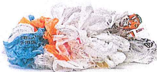
LOOSE PLASTIC BAGS