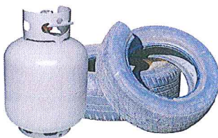
PROPANE TANKS & TIRES