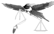
Minnesota American Indian Bar Association