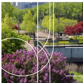
Active Green Space