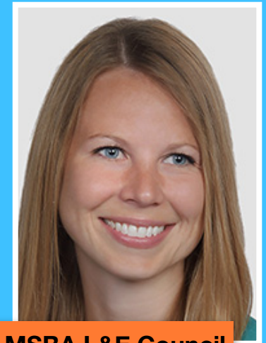
Moderator, MSBA L&E Council

Thursday, February 8, 2018 – 4 p.m. to 6 p.m. Mitchell Hamline School of Law, Kelley Board Room