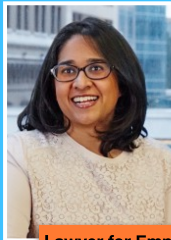
Lawyer for Employers