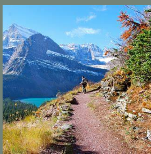
ISIT GLACIER NATIONAL PARK

Montana contains numerous mountain ranges in the western half of the state, while vast prairies and badlands are predominant in the East. Montana is comprised of seven large city districts: Billings, Bozeman, Butte, Missoula, Great Falls, Helena, and Kalispell. Many nearby towns provide abundant opportunities for small town living.